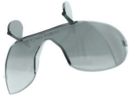
5835 - Universal Hard Tissue OD 4+ @ 1800-3000nm OD 5+ @ 10600nm