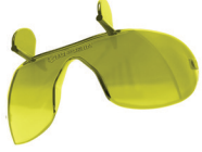
5838 - Diode Soft Tissue OD 5+ @ 800-830nm