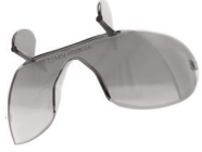
5836 - CO 2 0.3<OD<0.49 @ 520-535nm OD 6+ @ 9000-11000nm