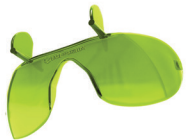
5832 - Universal Soft Tissue OD 4+ @ 800-<900nm OD 6+ @ 900-<980nm OD 7+ @ 980-1064nm OD 6+ @ >1064-1080nm