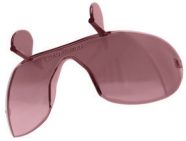
5843 - Pink Diode Soft Tissue Edition OD 5+ @ 800-830nm