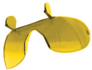
5839 - Curing Light OD 5+ @ 400 - 500nm