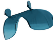
5842 - Multi-Wave OD 8+ @ 180-385nm OD 1+ @ 650 - <730nm OD 2+ @ 730 - <800nm OD 4+ @ 800 - <840nm OD 5+ @ 840 - <960nm OD 7+ @ 960 - 1400nm OD 4+ @ >1400 - <3000nm OD 6+ @ 10600nm