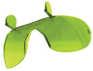
5837 - Dual Wave OD 5+ @ 800-900nm OD 6+ @ 900-<980nm OD 7+ @ 980-1064nm OD 6+ @ >1064-1080nm