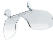
5844 - Clear CO 2 OD 5+ @ 190 - 390nm OD 6+ @ 9000 - 11000nm