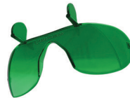
5845 - Tri-Wave OD 4+ @ 440-475 nm, OD 2+ @ 655-665 nm, OD 4+ @ 960-995 nm